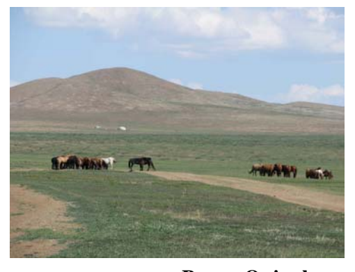
Bayan Onjuul area