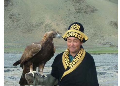
Kazakh hunter with his eagle

Cross the Hangai mountain range, see the holy peak of Otgontenger. In Arhangai, you will see the magical lake Tekhiin Tsagaan Nuur where you can make nice treks, observe the birds, fish (pikes especially). This route also crosses the Khorgo volcano national park and the beautiful canyon of Chuluut river. You will visit Kharhorin - the ancient capital of Chinggis Khan's Empire and Erdenezuu monastery. On the way to Ulaanbaatar, you cross Elsentasarhai - an area consisting of mixes of all landscapes: mountains, sands and rivers. Also visit Hustai national park and see wild horse Takhi – the only, truly wild horse remaining on Earth.