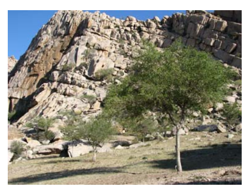
Trip J1. 7-days program Ulaanbaatar - Arkhangai - Ulaanbaatar

Travel in vast the steppes of the central area and Arkhangai mountains. To the south-east of Ulaanbaatar, you will see the northern edge of the Gobi desert - an infinite steppe with rocky mountains in middle. You will also find small sand dunes. Discover the picturesque valley of the Orkhon river, waterfalls, Tovhon monastery situated on top of forest mountains, visit Kharhorin - the ancient capital of Chinggis Khan's Empire and Erdenezuu monastery. On the way to Ulaanbaatar, you cross Elsentasarhai, an area consisting of mixes of all landscapes: mountains, sands and rivers. Also visit Hustai national park and see wild horse Takhi – the only, truly wild horse remaining on Earth.